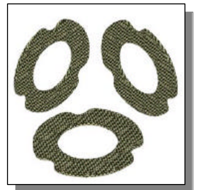
Kevlar-Carbon Composite Blades with By-Pass